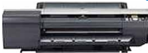
Canon iPF6400 Giclee 24" Printer