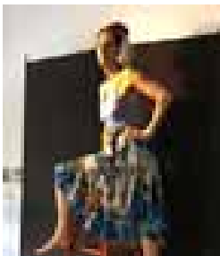
Recent model for Wednesday model lab group

So y'all come with your drawing and painting gear and do your own thing for three quiet hours of model time. It is a wonderful opportunity. Carol Rensink, 713-299-4136