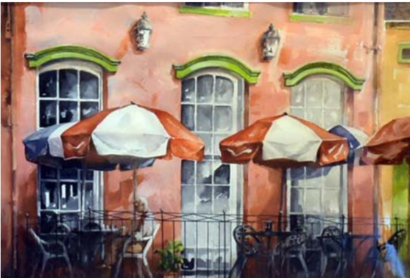
2nd place - William Tone "Morning Beignet"