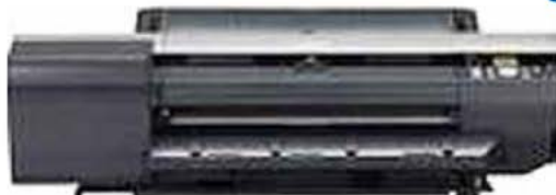
Canon iPF6400 Giclee 24" Printer