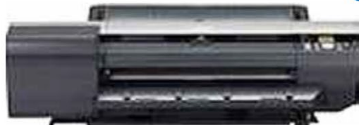
Canon iPF6400 Giclee 24" Printer