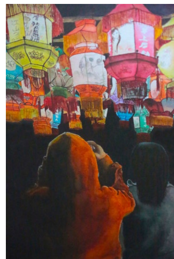
2nd place - Alison Hendry "Capturing the Festival Light"