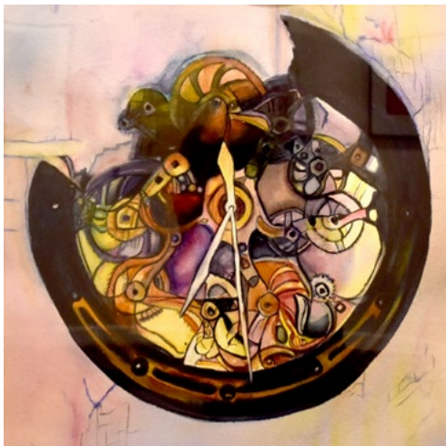
2nd place - Lynda Jung "No Time Is the Right Time"