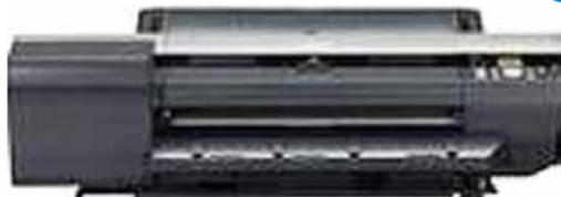
Canon iPF6400 Giclee 24" Printer