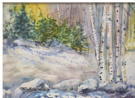
3rd Place "Sounds of Silence" by Patty Browning