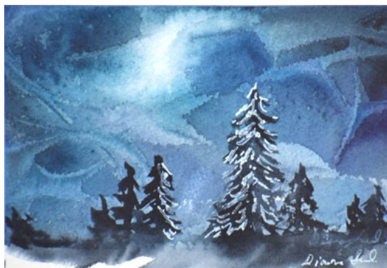
2nd Place "Follow the Star" by Dianatha Sneed