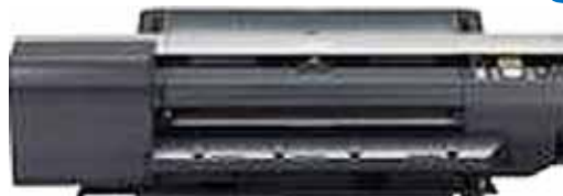
Canon iPF6400 Giclee 24" Printer