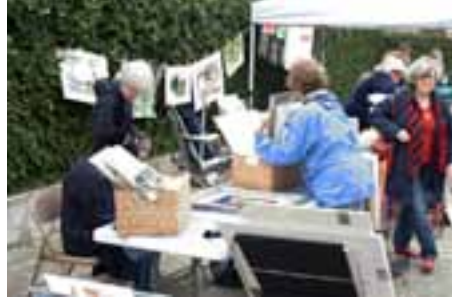
Art Fair – Mar. 25, 11:00 am - 4:00 pm