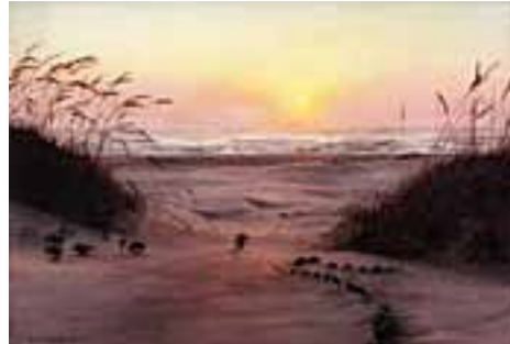
Seascape -by-Keiko Yasuoka

Keiko Yasuoka WAS-H, AWS, NWS, TWSA master "Seascape" Sat., July 8, 9:30 am - 3:30 pm (setup 9:00-9:30 am)