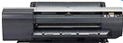
Canon iPF6400 Giclee 24" Printer