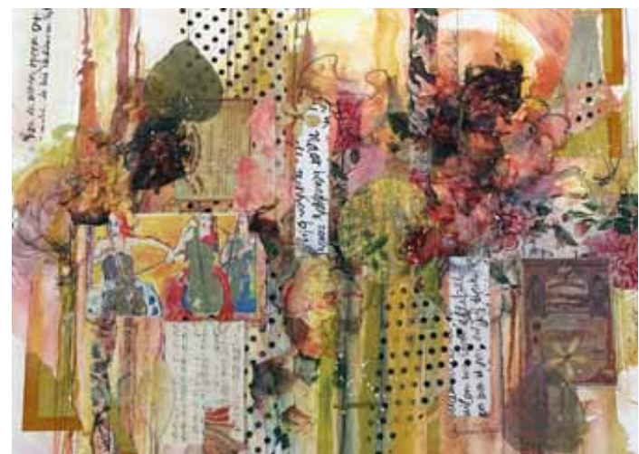
◀ 2nd Place: Susenne Telage , Sonata