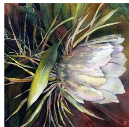
3rd Place: Patty Browning , Mystery of the Night