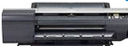
Canon iPF6400 Giclee 24" Printer