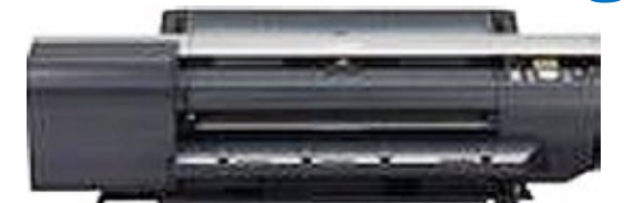
Canon iPF6400 Giclee 24" Printer