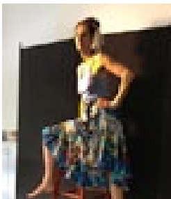
Recent model for Wednesday model lab group

So y'all come with your drawing and painting gear and do your own thing for three quiet hours of model time. It is a wonderful opportunity. Carol Rensink, 713-299-4136