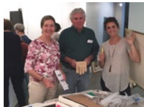
WAS-H members working at the hanging of the International Exhibition