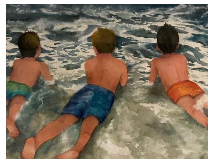
Beth Graham "Cousins Week at the Beach"

Judge: This painting is a little different with the scale of the figures filling up the composition. The scene has direction, action, focus and reflections. There is a slight awkwardness in the hunched poses that draw your attention in. I am particularly intrigued with the skin tone showing the beginnings of a sunburn, just like me when I have lost the sense of time