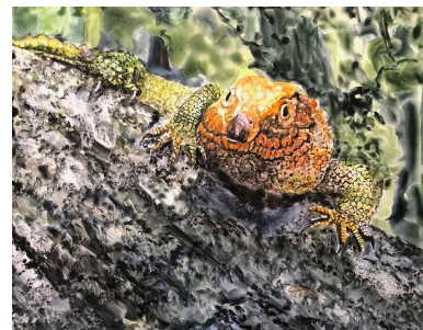
"Curious Caimen Iguana"