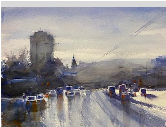
Landscape Painting Mohammad Ali Bhatti Four Friday afternoons April 7, 14, 21, 28 4:00 - 7:00pm $180 members/$220 non-members DETAILS & REGISTRATION