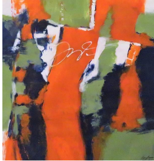
Abstract Painting for Enhancing Creativity, Part 1 Linda Southern Vanek Two Tuesday afternoons April 4 and 11 1:00 - 4:00pm $90 members/$110 non-members DETAILS & REGISTRATION