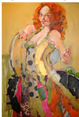
Figure Painting in Mixed Media

Liz Hill , www.lizhillart.com , 281-296-7522