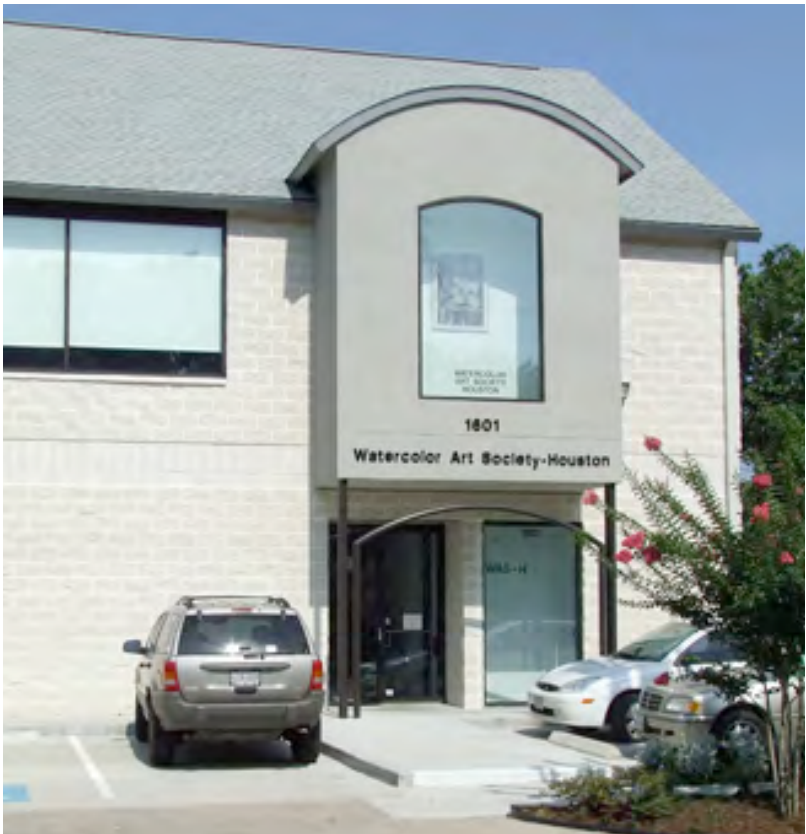
Watercolor Art Society - Houston (WAS-H)